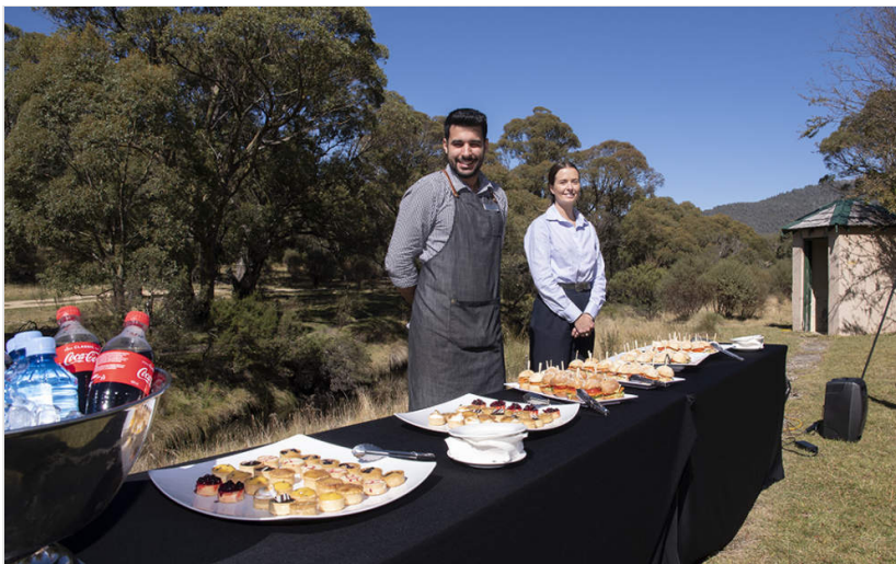
Lake Crackenback Resort staff supply lunch to the crowd.