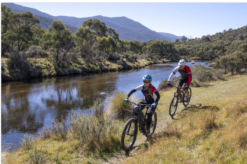
It was a perfect day for a mountain bike ride along the Thredbo River, especially after a $10 million announcement to