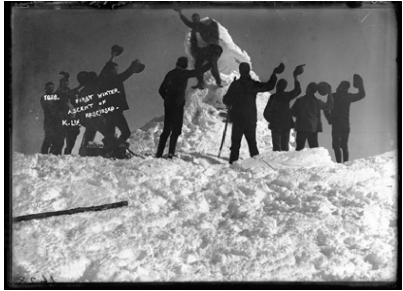
The first winter ascent of Mt Kosciusko.

No time was lost in making a start, as the cavalcade left the same day, in mild and beautiful weather and no snow being visible. Proceeding along the valley of the Thredbo River,