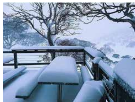
The deck of Alpine Eyre after a winter snow storm.

The Alpine Eyre (often referred to as Eyre Kiosk) is located at the bottom of the Eyre T Bar on the Kosciuszko Road at the southern end of Perisher Resort. Usually open all snow season (June long weekend - October long weekend) and in summer from Boxing Day. Cash only.