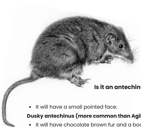
Is it an antechinus?